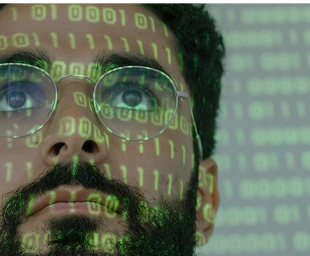
男性の顔にコードが投影されている写真