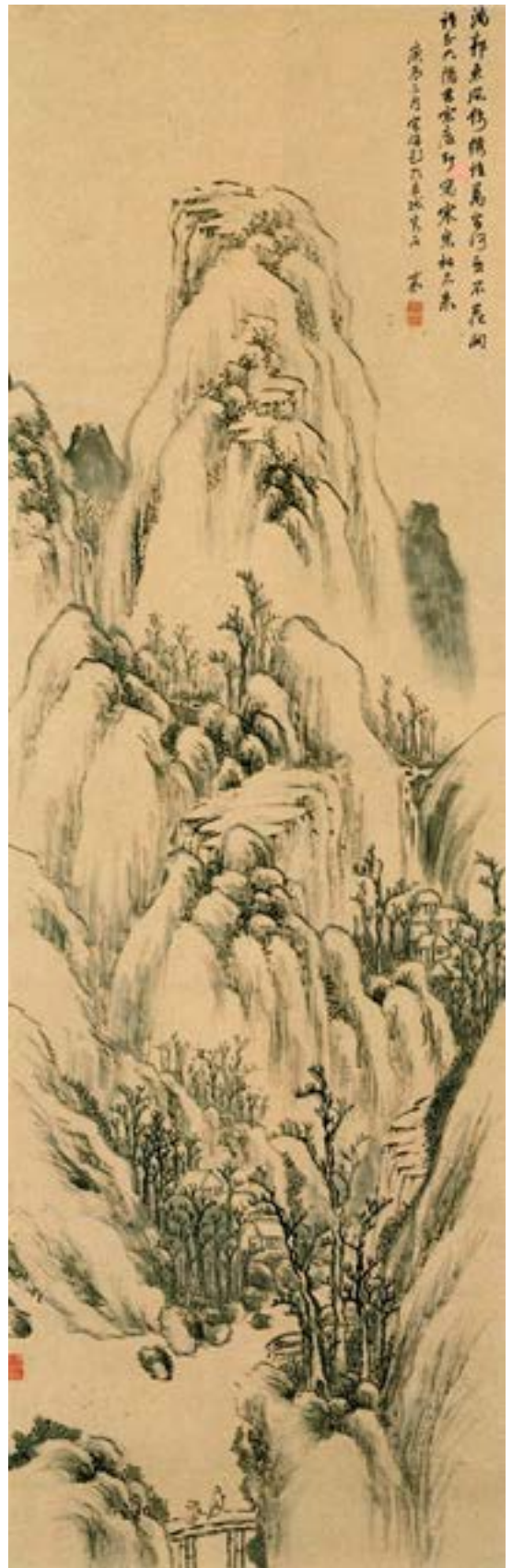
Wintry Trees ;hanging scroll, ink on paper 寒岩枯木図 紙本着色 Edo period,1820 江戸時代後期 SEIKADO BUNKO ART MUSEUM 静嘉堂文庫美術館 Rai San'yo(1780 - 1832) 頼山陽

The DH project was integrated in undergraduate and graduate teaching.