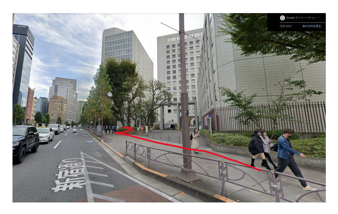
Walk past the North Gate.