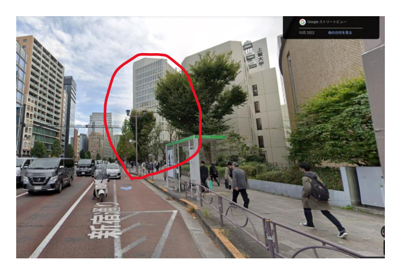
This is Building 6.

The easiest access to the talk venue, 6-503, is from the Shinjuku-dori (street) entrance.