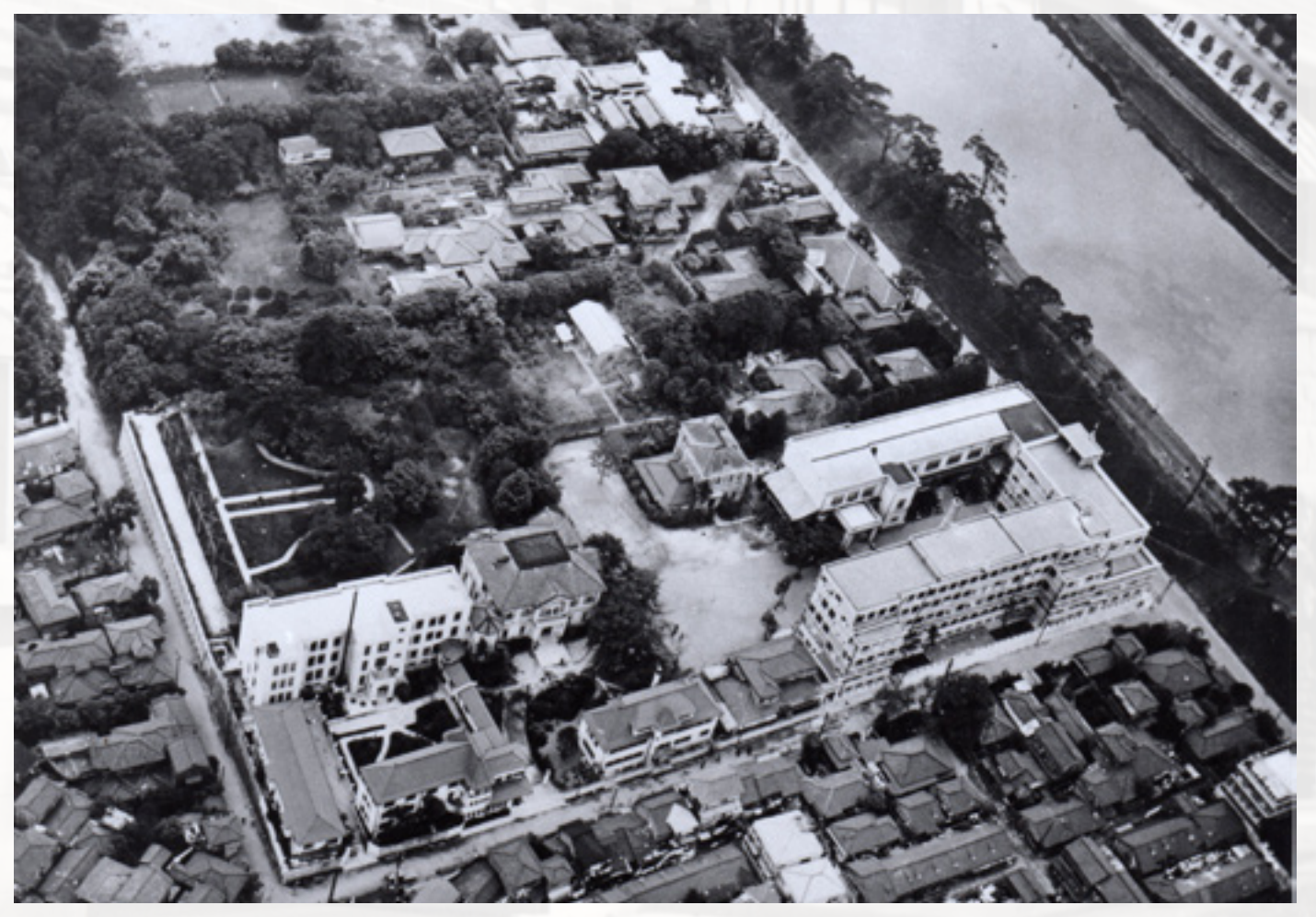
Image on page 1: Main Gate of Sophia University, ca. 1923. Image on page 3: Aerial view of Sophia University Campus, 1932.

We used the allocated budget for student support, for the digitalizing of primary sources, and for the copyediting of forthcoming publications.