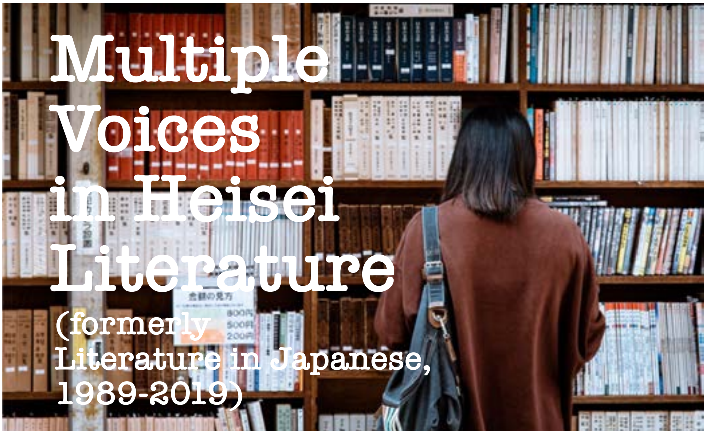
A woman reading a book